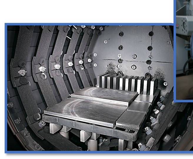
Kinetic's Abar Ipsen 6 bar 36" x 36" x 72" Vacuum Furnace

www.knifemaker.com Contact us: (414) 425-8221 or info@knifemaker.com